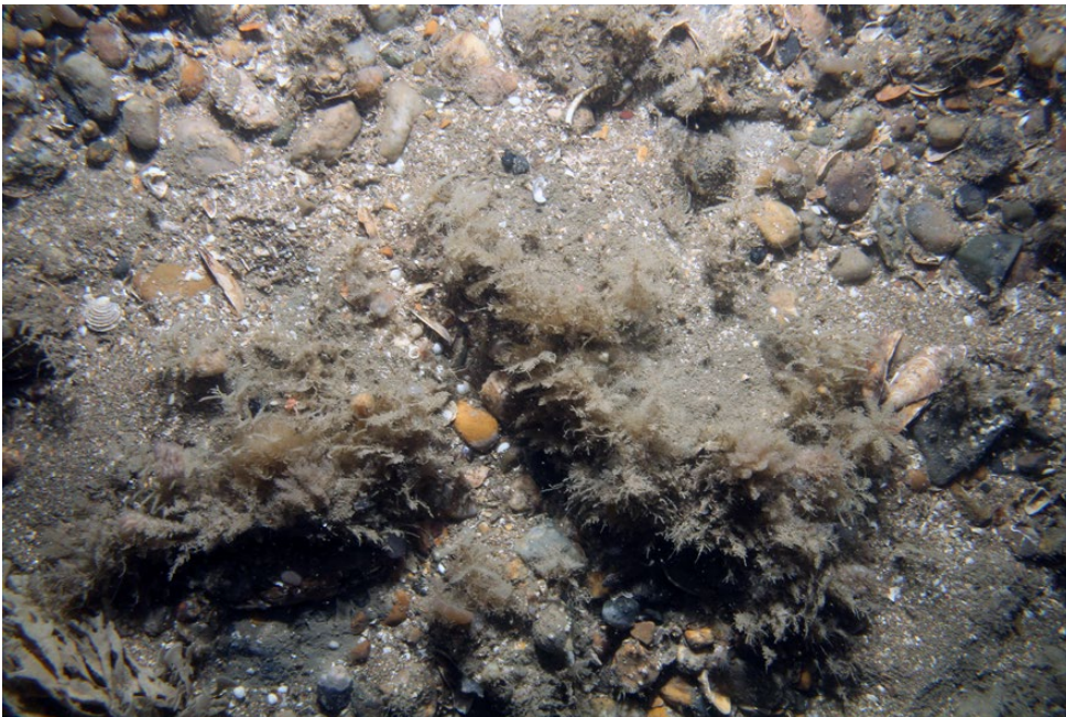
Biotope Code and Name - SS.SMx.CMx.FluHyd Flustra foliacea and Hydrallmania falcata on tide-swept circalittoral mixed sediment Station 20 H1