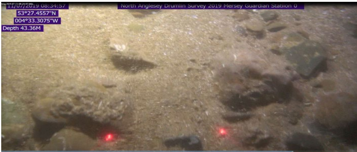
Biotope Code and Name - SS.SCS.CCS Circalittoral coarse sediment Station_00_H1