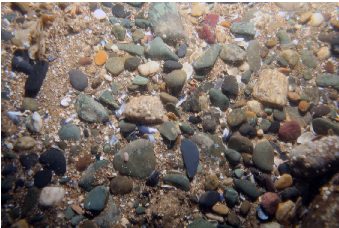
Biotope Code and Name - SS.SCS.CCS Circolittoral coarse sediment. Station_06_H1.