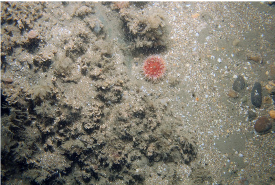
Biotope Code and Name - CR.HCR.XFa.FluCoAs.SmAs Flustra foliacea , small solitary and colonial ascidians on tide-swept circalittoral bedrock or boulders Station 20 H2