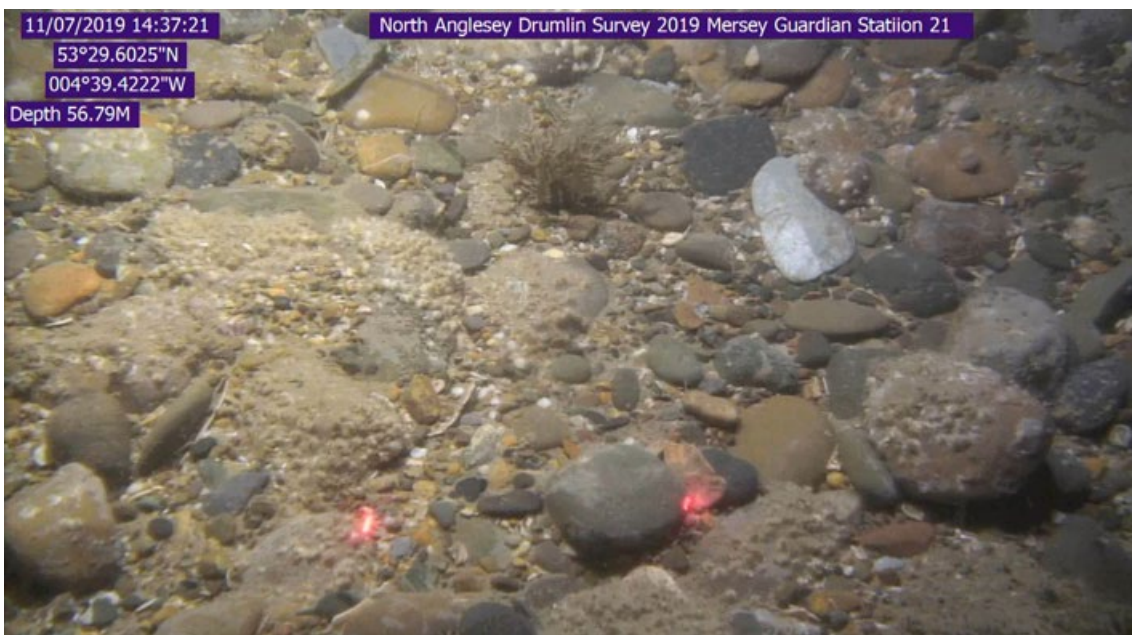
Biotope Code and Name - SS.SCS.CCS Circalittoral coarse sediment Station_21_H1