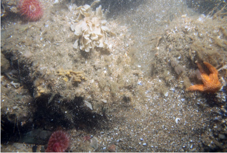
Biotope Code and Name - CR.MCR.EcCr.FaAlCr.Flu Flustra foliacea on slightly scoured silty circalittoral rock Station 07 H2