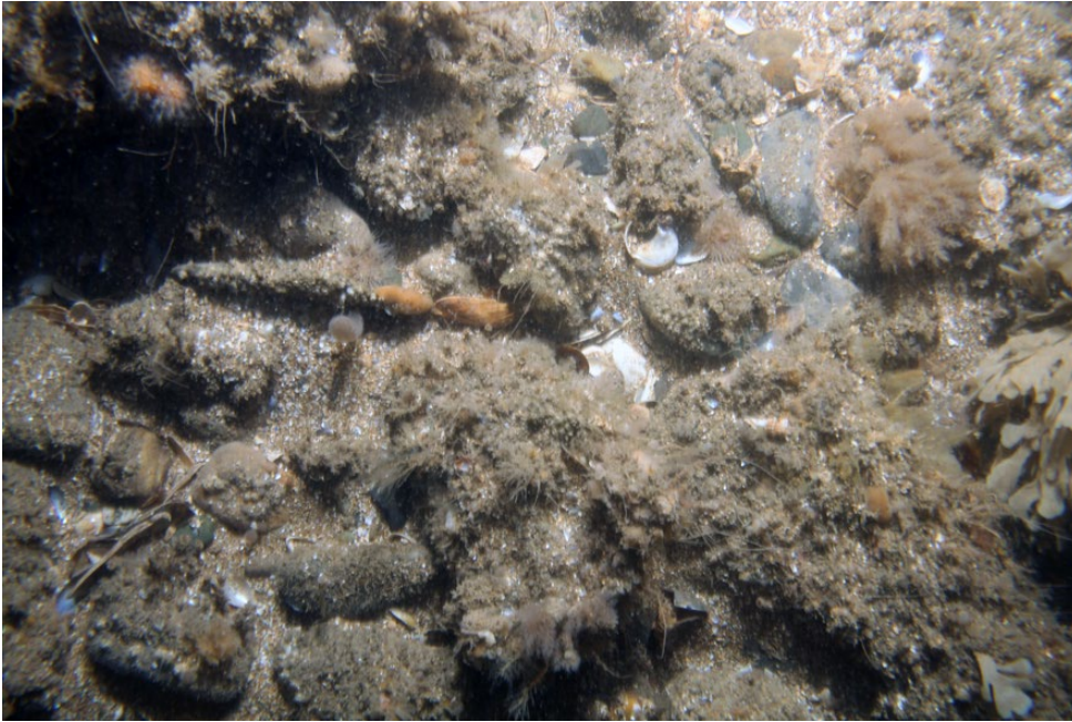
Biotope Code and Name - CR.MCR.CSab.Sspi.ByB Sabellaria spinulosa with a bryozoan turf and barnacles on silty turbid circalittoral rock Station 05 H1