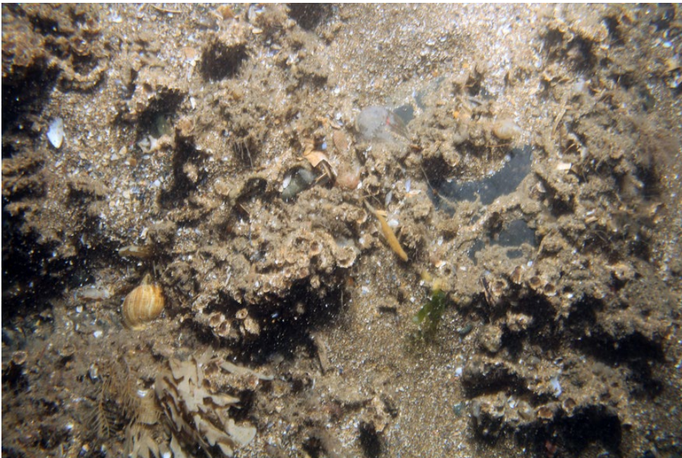
Biotope Code and Name - SS.SBR.PoR.SspiMx. Sabellaria spinulosa on stable circalittoral mixed sediment. Station 05 H2