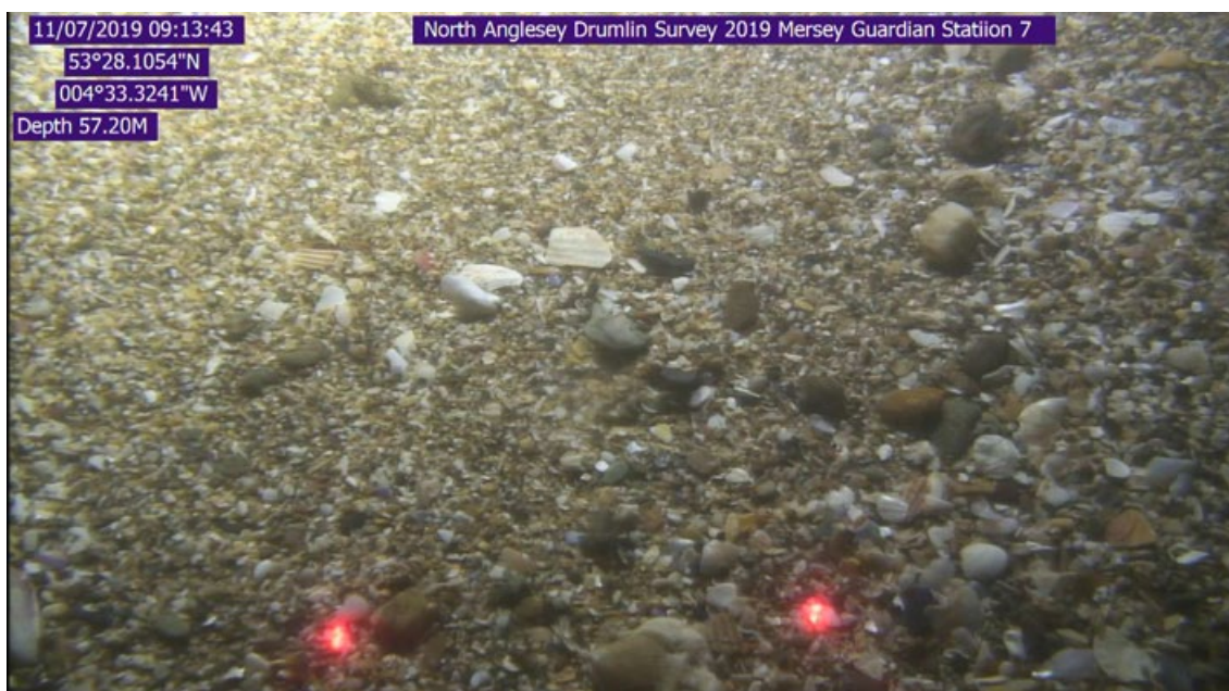
Biotope Code and Name - SS.SCS.CCS Circolittoral coarse sediment. Station_07_H1