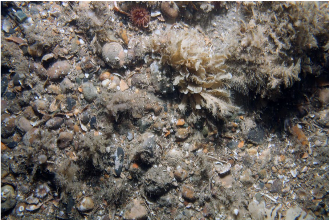
Biotope Code and Name - CR.MCR.CSab.Sspi.As Sabellaria spinulosa , didemnids and other small ascidians on tide-swept moderately wave-exposed circalittoral rock St 20 H2