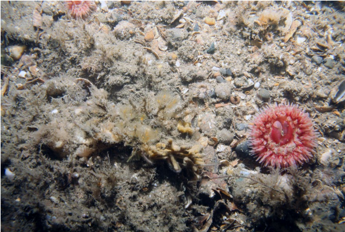
Biotope Code and Name - CR.HCR.XFa Mixed faunal turf communities Station 20 H1