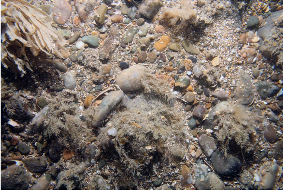
Biotope Code and Name - SS.SMx.CMx.FluHyd Flustra foliacea and Hydrallmania falcata on tide-swept circalittoral mixed sediment Station 12 H1