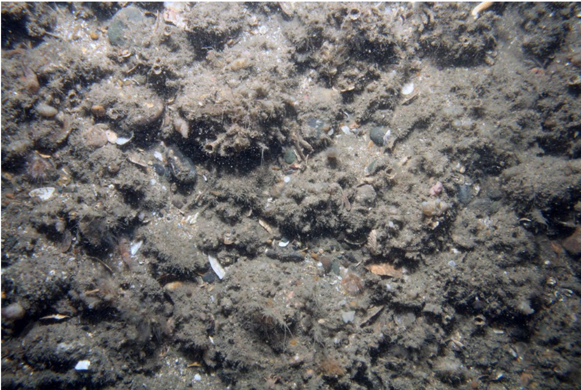
Biotope Code and Name - SS.SBR.PoR.SspiMx. Sabellaria spinulosa on stable circalittoral mixed sediment. Station 21 H1