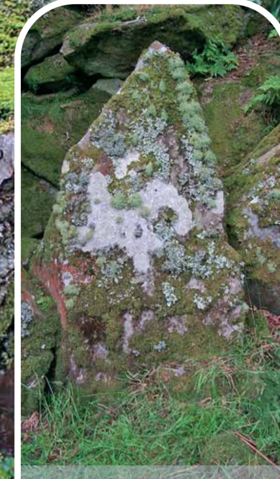
cennau ar garreg lichen on rock