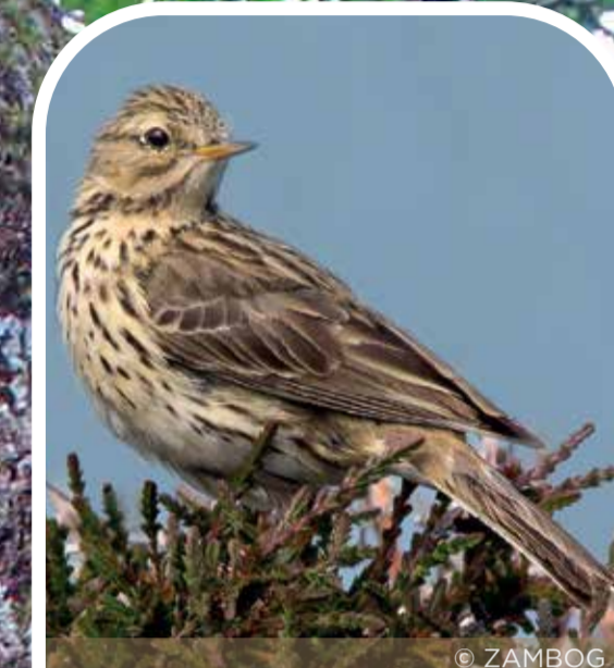
corheddyd y waun meadow pipit

The gnarled and twisted oaks growing over rock outcrops, abundance of old stone walls, an iron age fort, and the nearby Neolithic burial chamber of Pentre Ifan, all reflect a landscape with a long connection with people and a mystical feel.