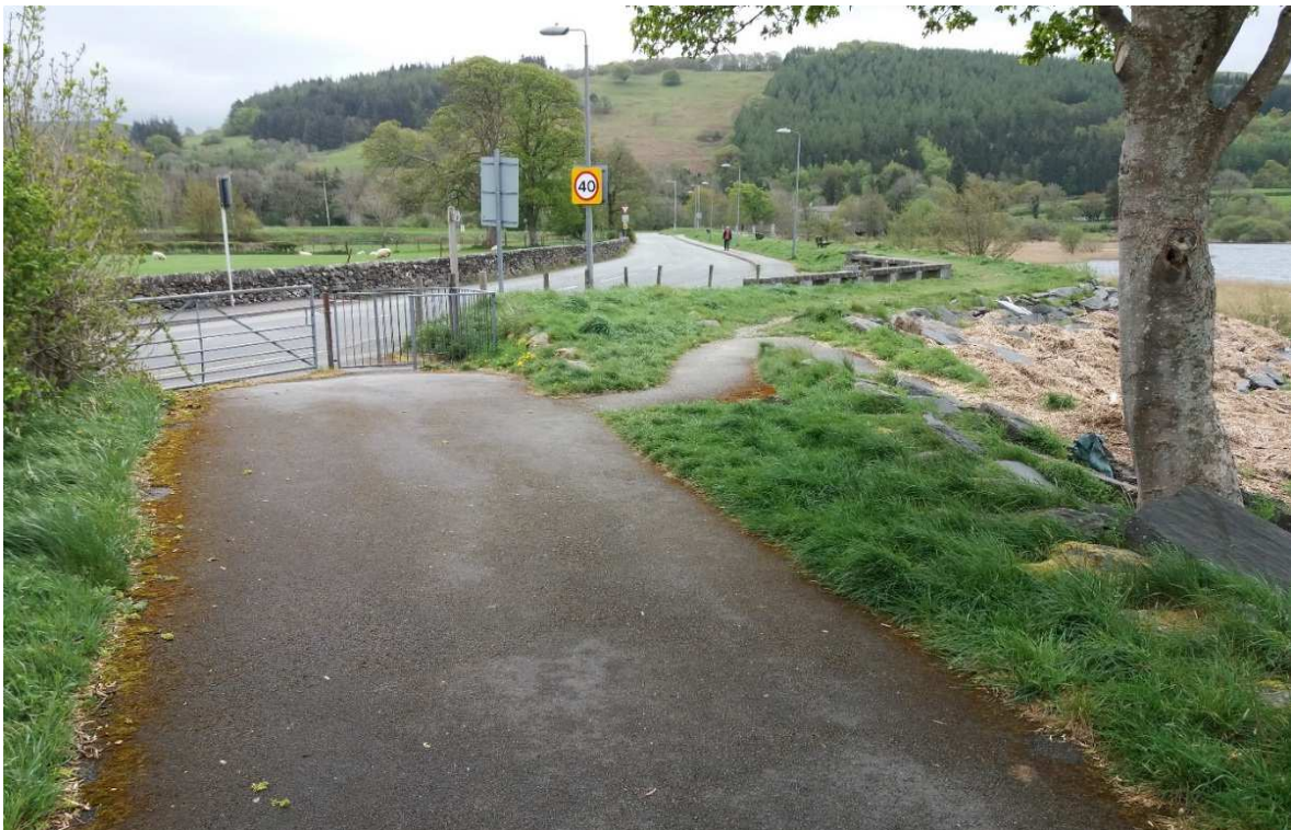
Plate 4. Access onto lake embankment from Tegid Street with 'bandstand' in the distance