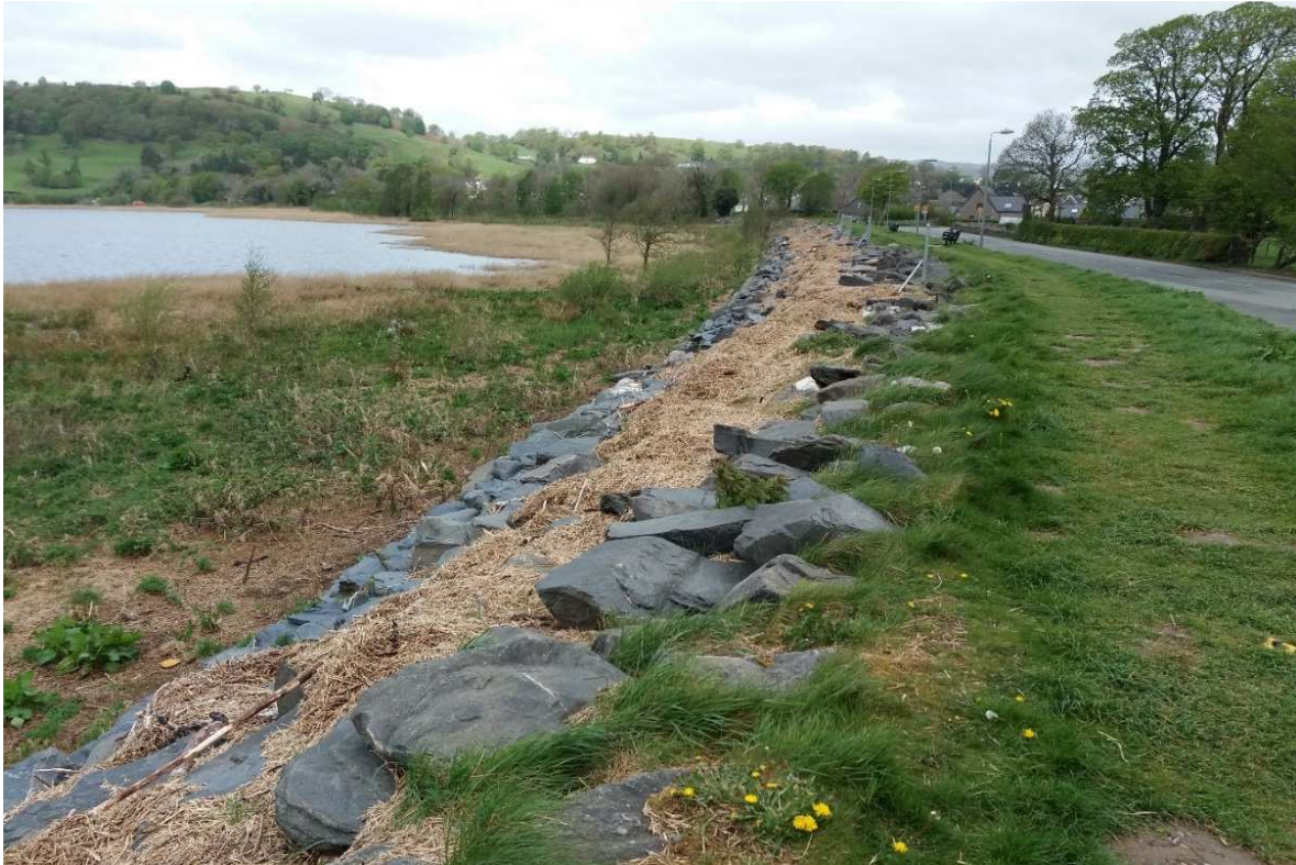
Plate 3. Lake embankment looking north-west towards Penllyn Leisure Centre