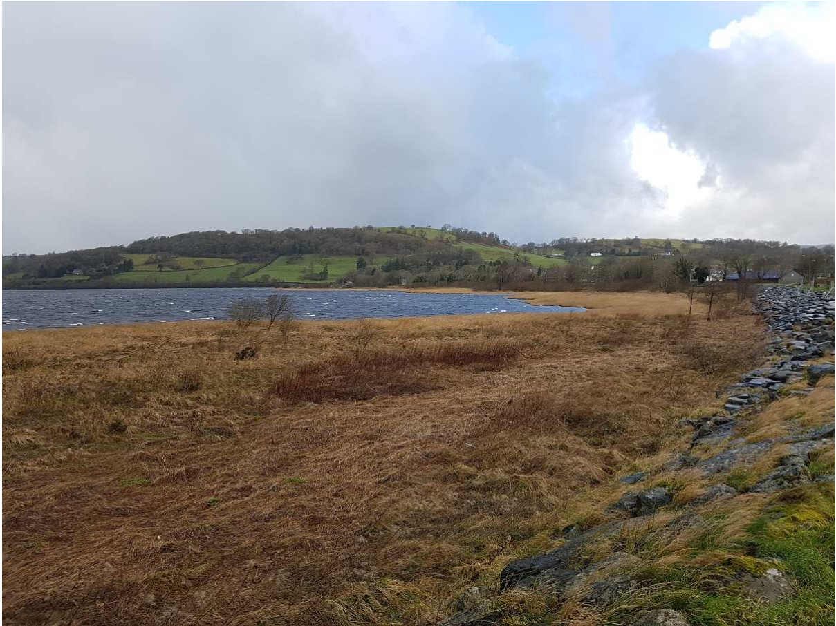
Plate 1. Llyn Tegid looking west