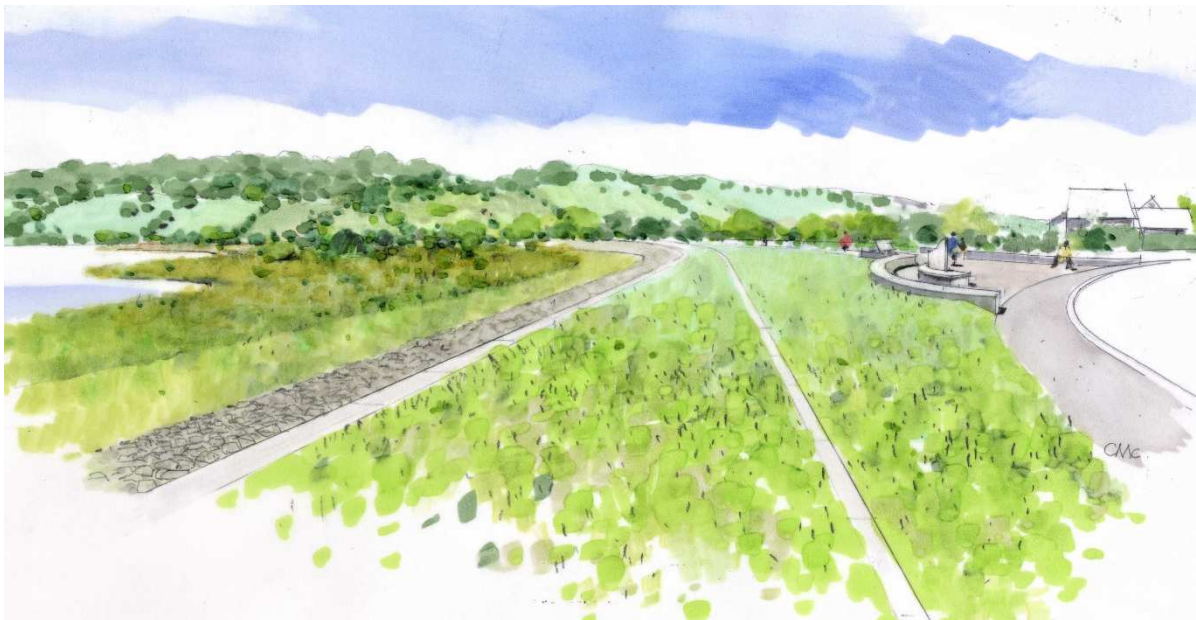
Figure 4: Illustration (View 04)

View 04 is taken from crest of the Llyn Tegid embankment adjacent the B4391 (Tegid Street), looking North West toward the 'Bandstand' seating area and Rugby Club beyond. This viewpoint shows the only location within the scheme where there is a proposed change to the alignment of the existing embankment. The images provided illustrate the effect of this change, along with the interaction of the proposed route of the Bala Railway extension. It also shows the removal and replacement of the existing seating area, and the effect of the loss of vegetation resulting from the embankment protection works. The illustration from this viewpoint is shown below.