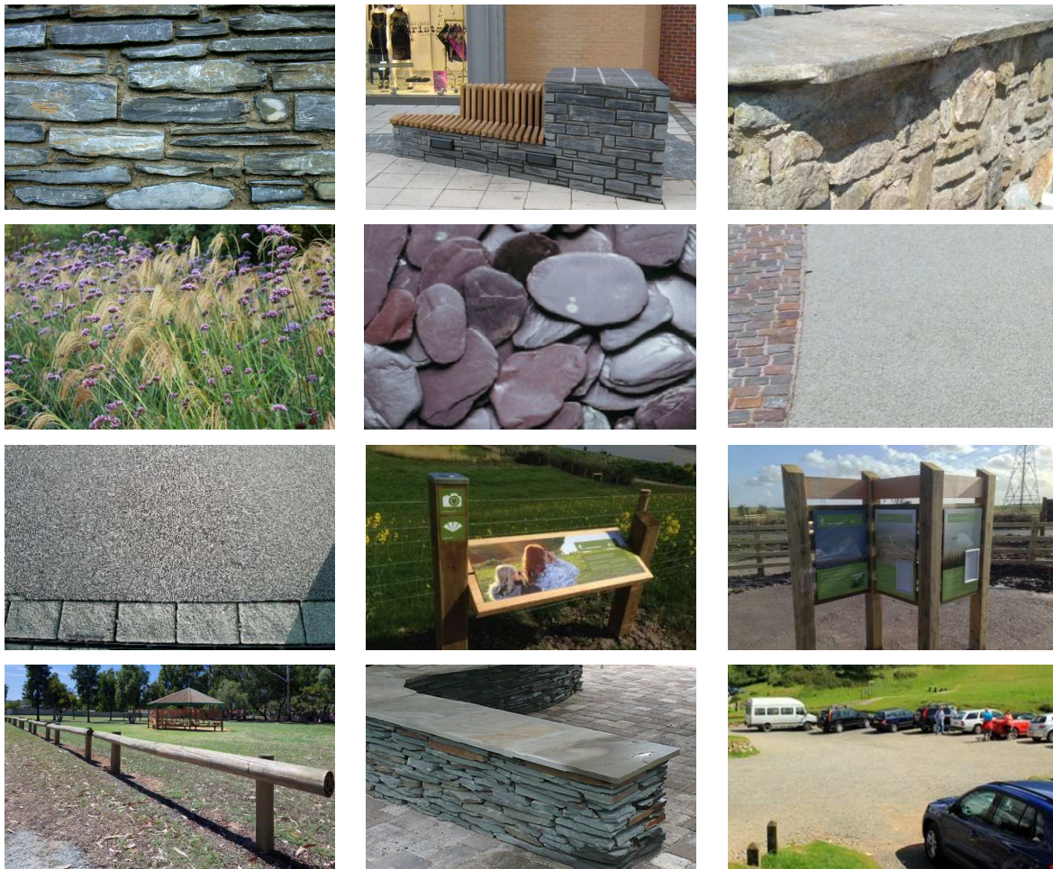
Figure 5: Precedent images used to inform landscape enhancement concepts and materials