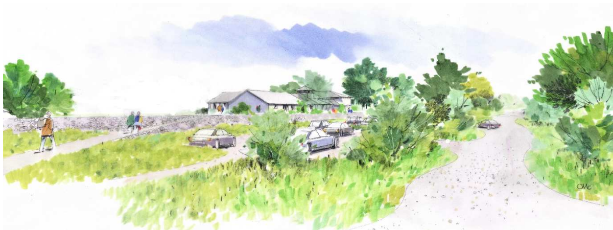
Figure 2: Illustration (View 01)

View 01 is taken from the lake foreshore parking area, adjacent the Bala Adventure and Watersports Centre. The annotations and illustration highlight the effect of the removal of trees and vegetation from the embankment face, opening up views to / from the Penllyn Leisure Centre. It also shows the enhancements to the lakeside informal parking area, and access improvements with the replacement of the existing ramp between foreshore and embankment. The illustration from this viewpoint is shown below.