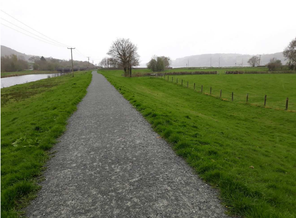
Plate 2. River Dee embankment looking southwest towards Llyn Tegid