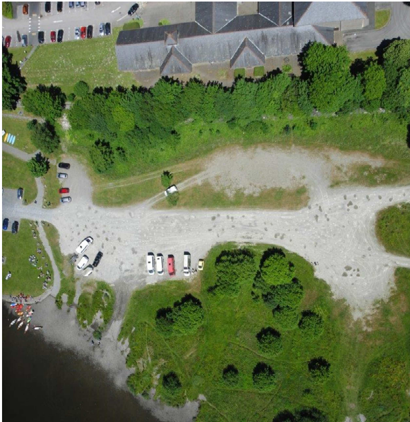
Plate 5. Aerial (drone photograph) view of existing overflow car park