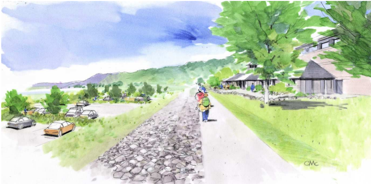
Figure 3: Illustration (View 02)

View 04 is taken from crest of the Llyn Tegid embankment adjacent the B4391 (Tegid Street), looking North West toward the 'Bandstand' seating area and Rugby Club beyond. This viewpoint shows the only location within the scheme where there is a proposed change to the alignment of the existing embankment. The images provided illustrate the effect of this change, along with the interaction of the proposed route of the Bala Railway extension. It also shows the removal and replacement of the existing seating area, and the effect of the loss of vegetation resulting from the embankment protection works. The illustration from this viewpoint is shown below.