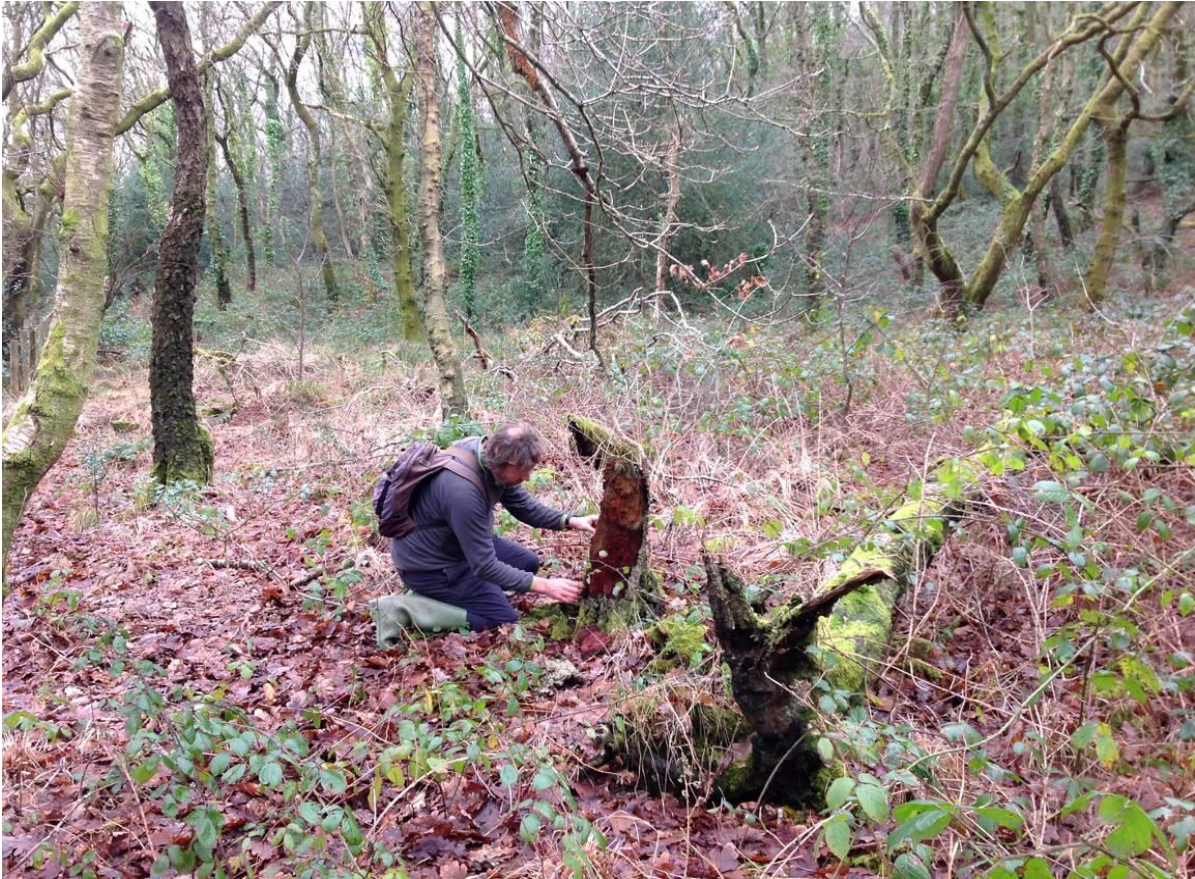
Figure 4.3: Blue Ground Beetle Carabus intricatus over-wintering site in old birch stump at the eastern end of the reserve.