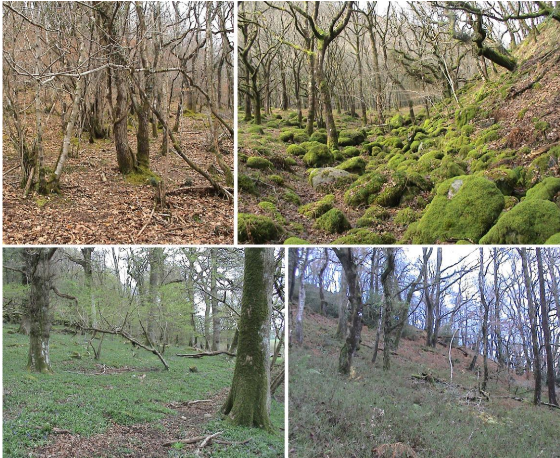
Figure 3.1. Carabus intricatus habitat on Dartmoor and Bodmin Moor.

The adult beetles are mainly active from late-March to early-July and are long-lived, perhaps surviving for two to three years or longer. At night they climb tree trunks in search of food and potential mates. Slime trails are followed in search of their favourite prey, the tree slug Lehmanna marginata . The beetle grips on to the slug with its pincer-like jaws and then injects digestive juices into its victim. This quickly kills and dissolves the slug's body into a 'soup' which can be sucked up by the beetle. In the course of half an hour an adult can devour a slug larger than itself. Caterpillars are also consumed in a similar manner. Like many other ground beetles, C. intricatus is a spring breeder, with eggs laid during the spring and larvae, which also feed on slugs, developing rapidly over the summer months. The new adult generation emerges in August and September and overwinter in cells that are usually sited beneath bark and moss on dead trunks, stumps and branches of a range of deciduous trees (Boyce & Walters, ibid. ).