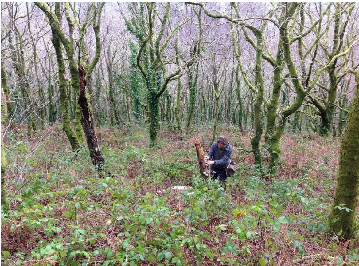
Figure 5.2. Coed Maesmelin Wood showing bramble encroachment.