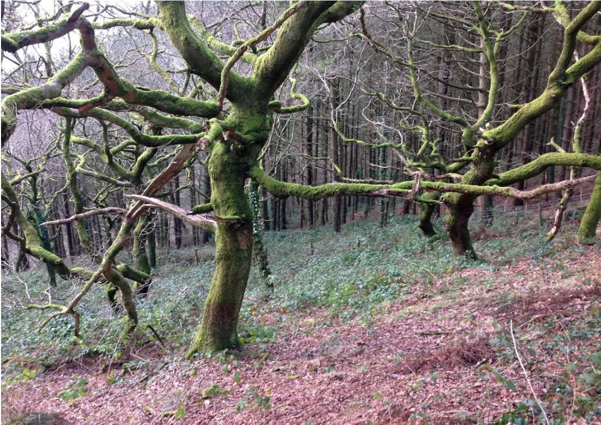
Figure 5.1. Blue Ground Beetle Carabus intricatus habitat at the western edge of the reserve. Here there are still areas of ground relatively free of bramble encroachment.