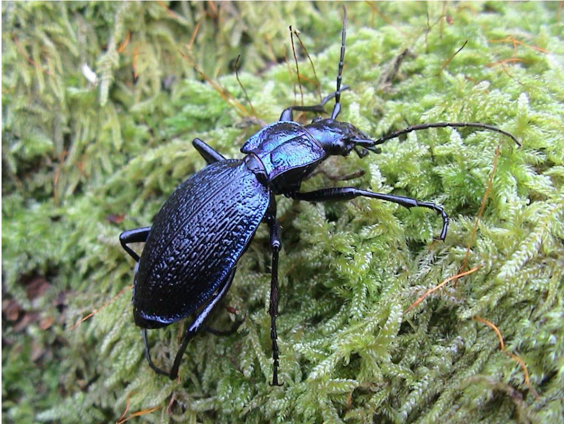
Figure 3.2. Blue Ground Beetle Carabus intricatus Coed Maesmelin 22 January 2015