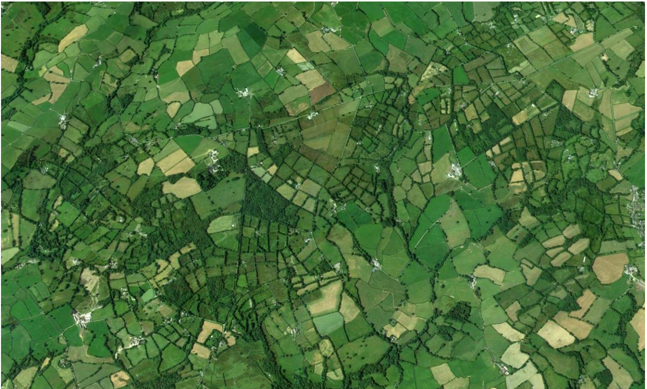
Mixed fieldscapes near Salem (north of Llandeilo) where clusters of small fields have thicker much hedgerows.