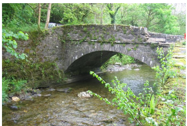
(Left) The unusual and distinctive abundance of laburnum in hedgerows. In early summer, this local peculiarity becomes apparent, when they burst into vivid yellow flower, and the lanes are adrift with fallen blossom. (Right) Stone bridge near Capel Iwan