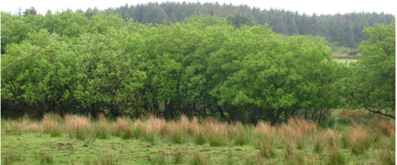
Rush Pasture and carr near Brynalwan