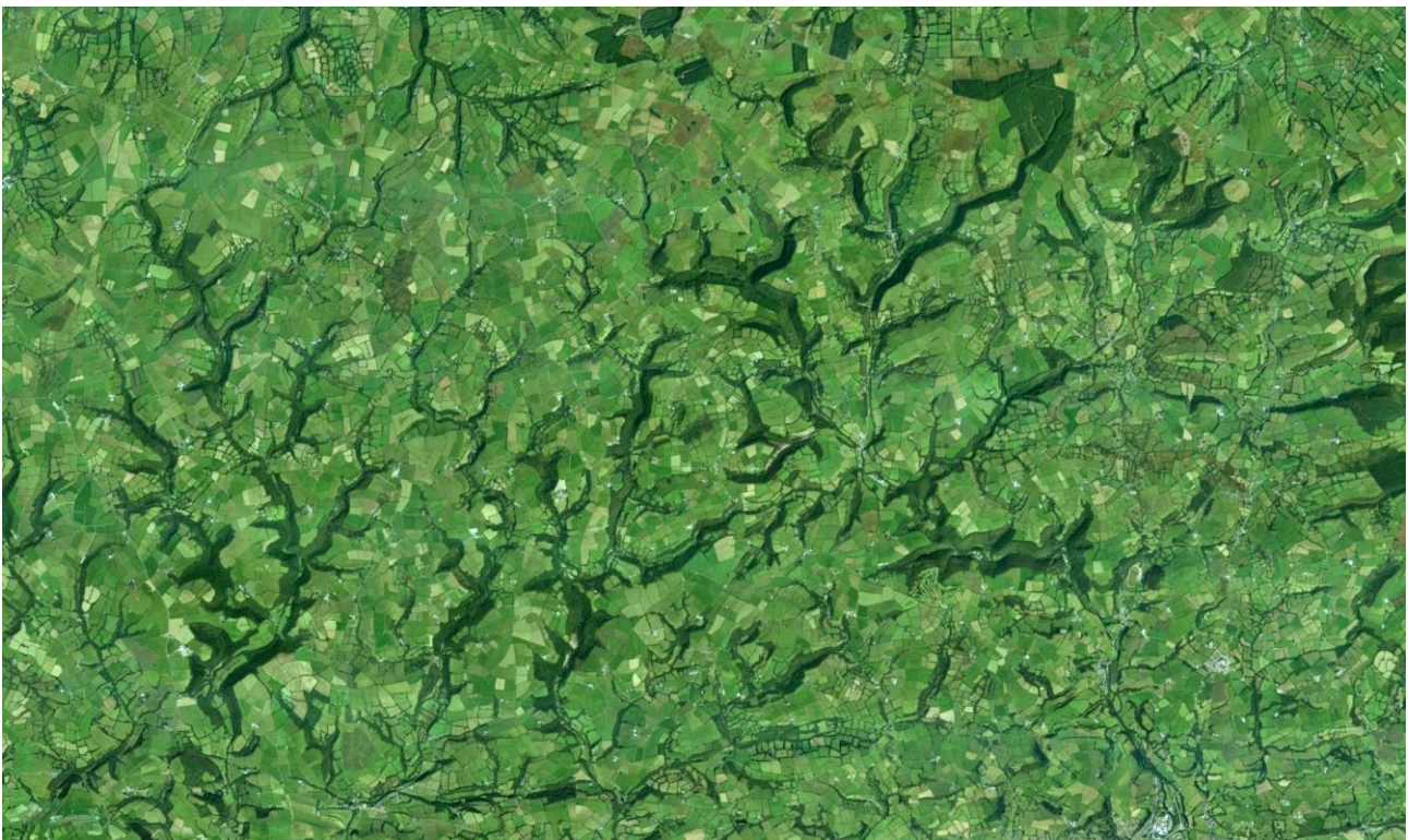
The distinctive pattern of many incised streams in narrow wooded valleys.