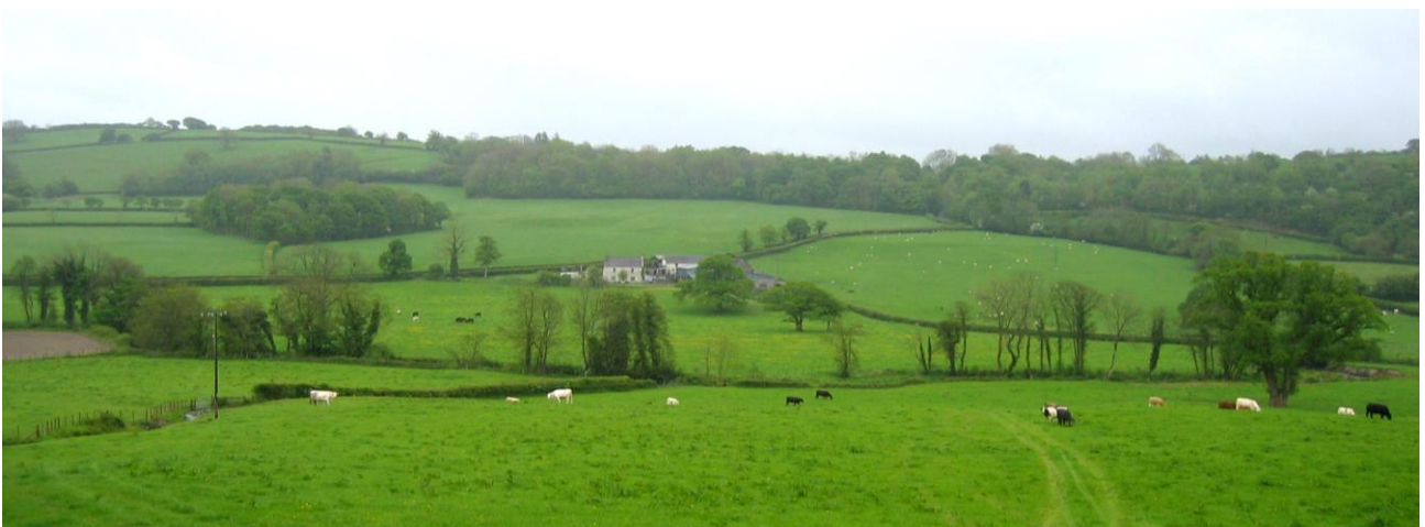
View east from near Talley

West of the Carmarthen-Lampeter road, where the Cambrian Mountains have dropped away, this part of the area covers a wider stretch of land between the two major vales of the Teifi and the Taf. Here the water courses have cut deep into the plateau, flowing both north and south, giving a particularly distinctive pattern of ridges dropping gradually southward and northward from a central line of higher points. To both north and south, this area merges with the adjacent areas of the Teifi Valley and Pembrokeshire. When viewed from distant higher land, the plateau can be seen to gradually rise, with the Blaenwaun windfarm being the only obvious landmark. The deep steep winding wooded valleys are quiet and enclosed, with very limited views, full of detail. Small villages and farms are tucked into the lower slopes at bridging points, backed by dark woodland and bright meadows, forming picturesque groups of buildings, often losing the sun early in the day. Others are perched on the rims of the valleys, clustered around ancient inconspicuous churches. Only the Gwili valley, with the winding Carmarthen-Newcastle Emlyn road and the preserved steam railway, has much noise and movement through it. Most of the roads run straight along the ridges, between sparse wind-bitten hedges, through a fairly uniform, wide-spreading landscape of regular fields of pasture and crops. Small lanes branch off to zigzag sharply down to cross the valleys.