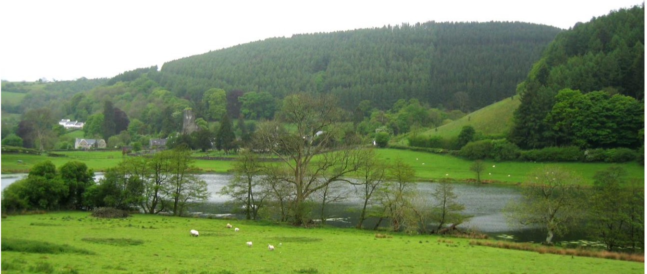
Woodland and pools near Talley.