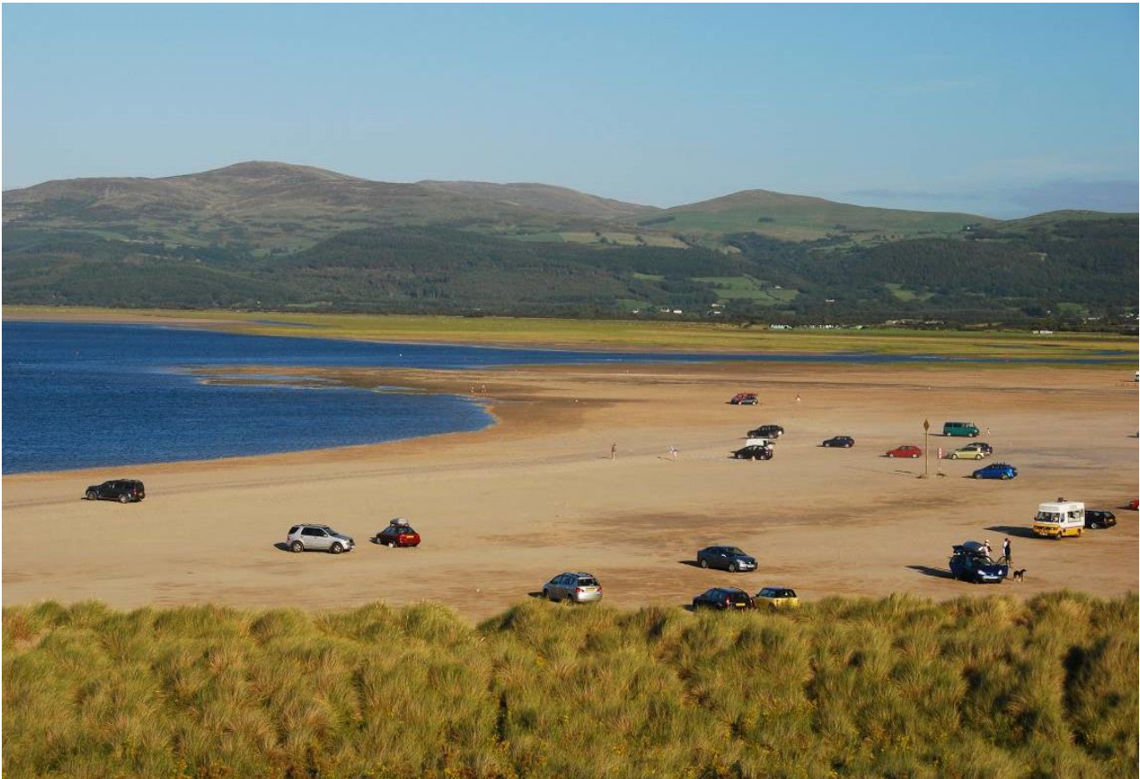
View from Ynys Las across the Dyfi estuary towards the Cambrian Mountains.