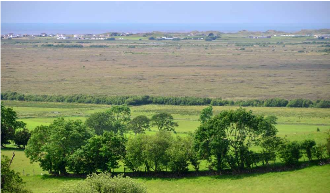
The extensive raised bog, inland from Borth.