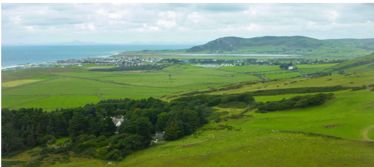
The coastal lowlands and town of Tywyn, and the smaller estuary of the Dysynni.

The enclosed farmed valley contrasts with the much wider estuary, where inter-tidal areas, a salt marsh and lowland raised bog (with heather scrub) occupy much of the flat ground. Farming, settlement and the main transport routes are confined to the edges of these areas. In particular, Aberdyfi’s splash of colour contrasts with the exposed and simple character of the coastline itself, open estuary, coastal raised bog and nearby upland areas.