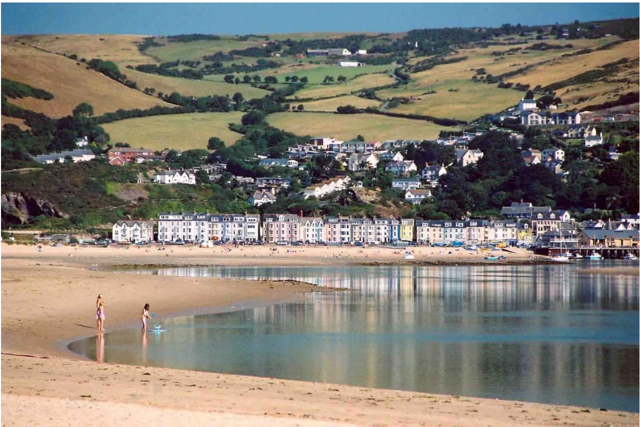
The resort town of Aberdyfi, on northern shore at the mouth of the Dyfi estuary.