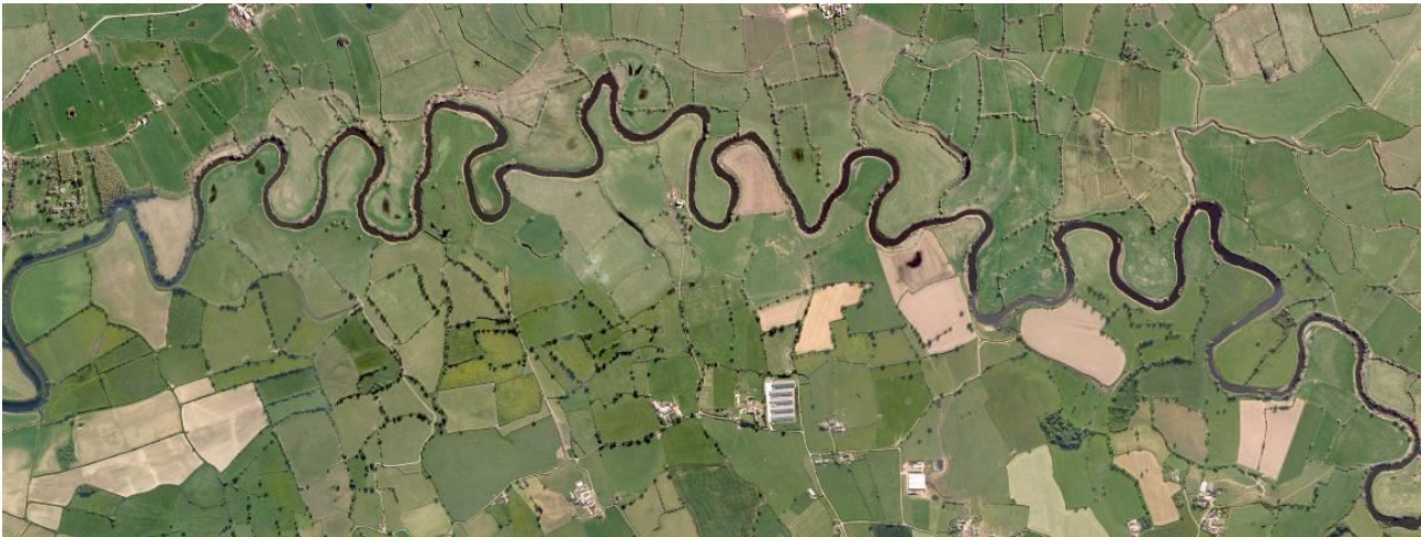
The meandering course of the River Dee near Isycoed/Caldecott

hedgerow trees. A particularly distinctive feature is the remnant Medieval ridge and furrow open field system, which underlies the more recent landscape. These ridge and furrow corrugations are most apparent at dusk and dawn, when the sun is low, or after light dustings of snow.