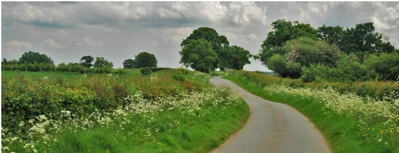
A typical undulating rural scene in the west of the area, this one being near Overton.