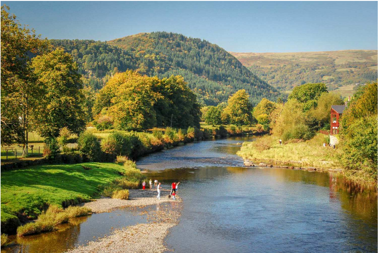
The gentle gradient of the river at Llanwrst contrasts to the dramatic, rising, adjacent wooded hillsides of Snowdonia to the west.