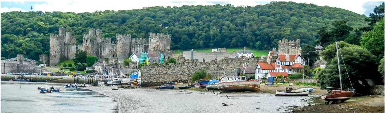
The lower estuary is developed on both sides, including quays and boating activity. The World Heritage Site castle (above) and historic walled town (below) of Conwy.

The estates of the new-rich of the 19th century, such as Benarth and Bodnant, perpetuate the tradition of horticulture and ornamental landscapes which trace their origins to the renaissance gardens at Gwydir and the lost Dutch garden at Maenan Abbey.