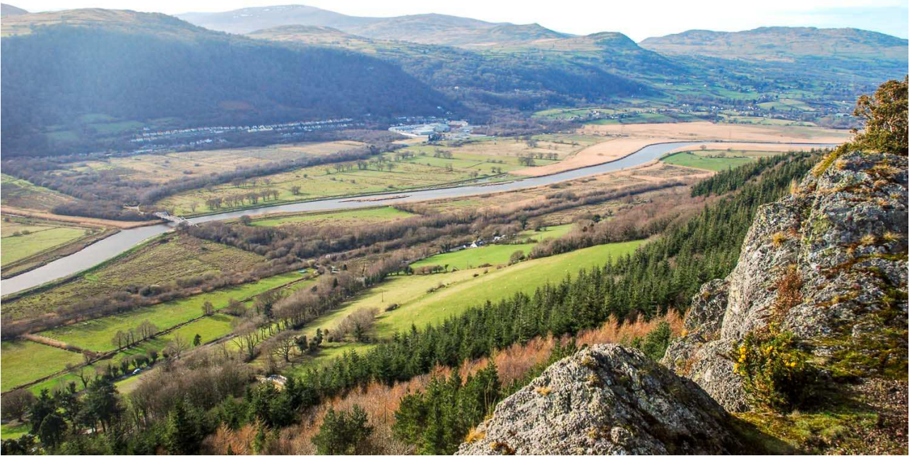
From Cadair Ifan Goch, we look across to the linear village of Dolgarrog with its former Aluminium works site.