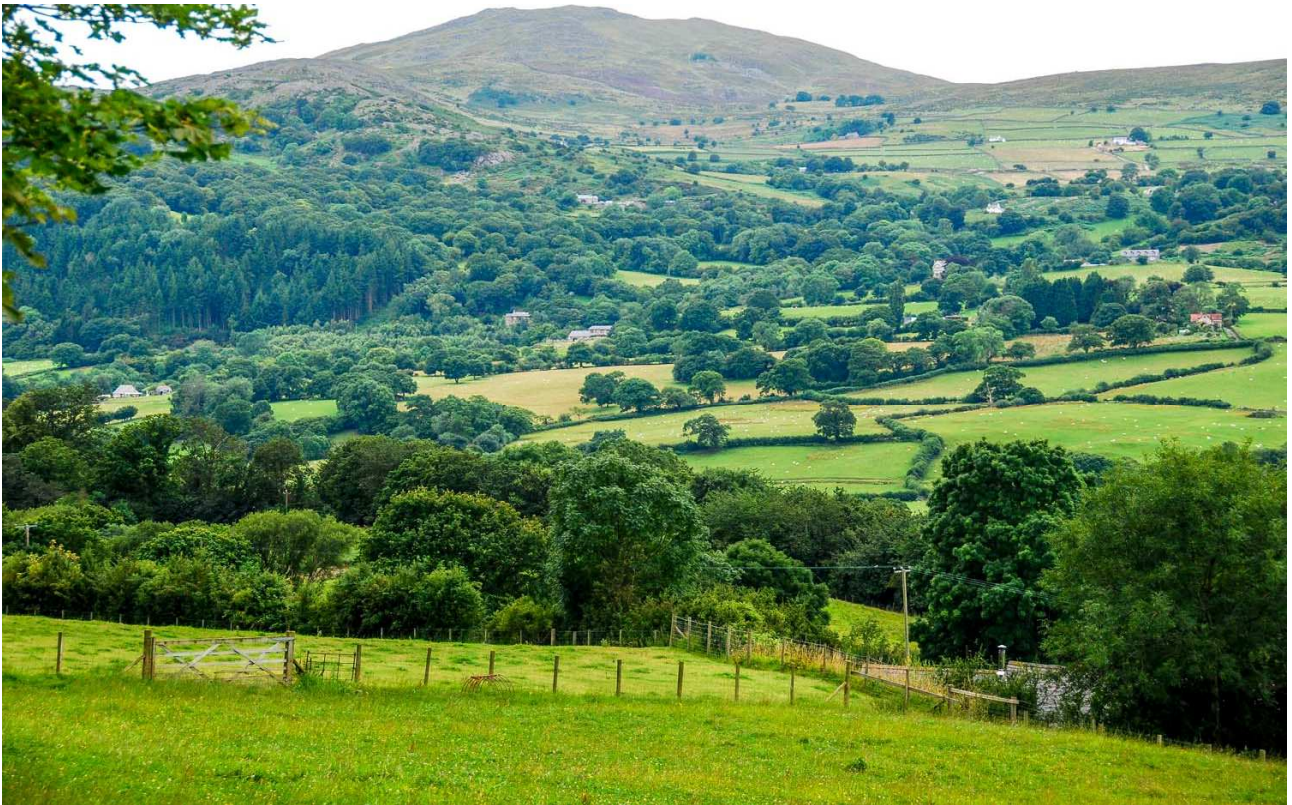
The rural character, with pastures, and woodlands on hillsides, rising up to the mountains of Snowdonia, as seen here near Rowen.