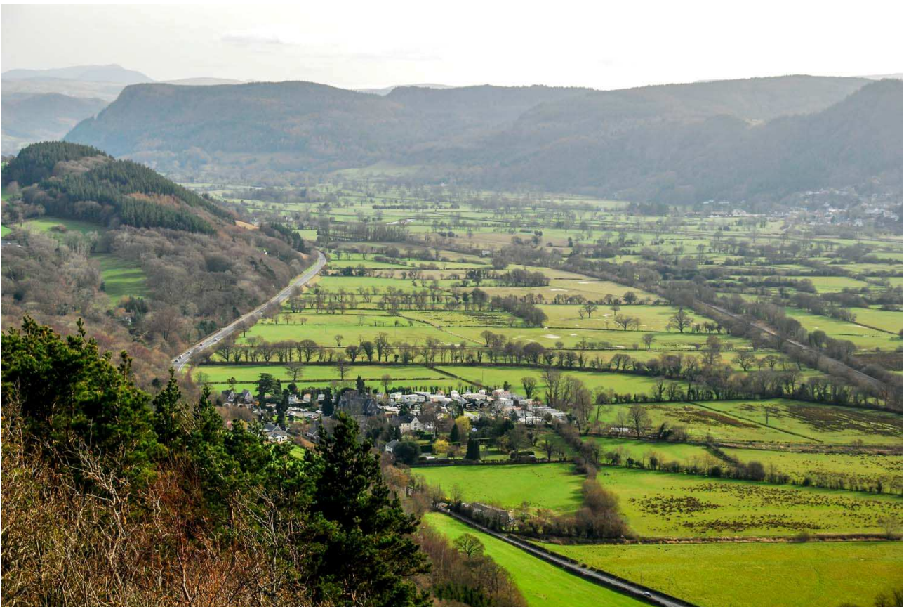
From Cadair Ifan Goch, looking up the Conwy Valley, Trefriw village is on the right. Road and rail routes are seen, but roads tend to keep to the edge of the flood plain.