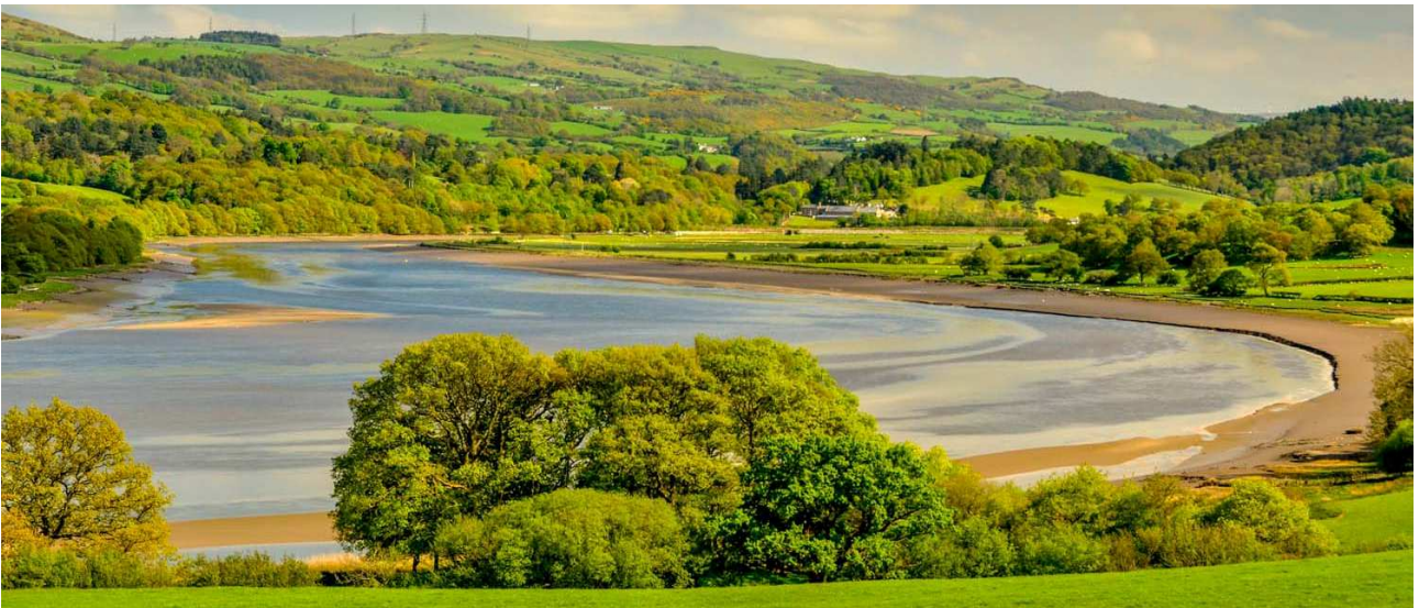
Looking up the middle estuary, which meanders between rolling valley hills covered with a patchwork of woods and pastures. The gentle hills of Rhos rise beyond to the east.