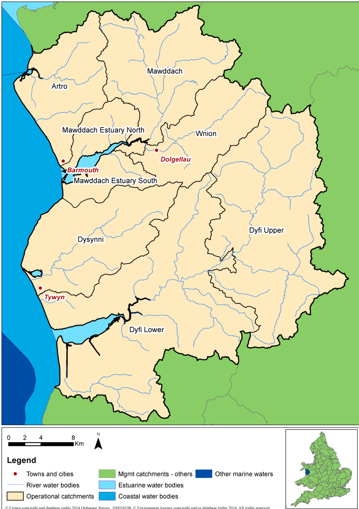
Figure 1. Meirionnydd Management Catchment map